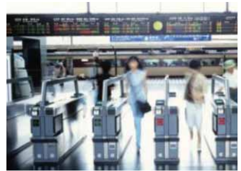
Access control and Ticketing